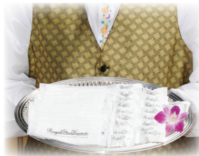
Mint and Hand Towelette Service