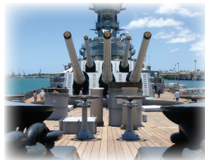
Reserved Ticket for USS Missouri (2 hours on-site)