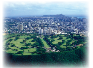
Punchbowl National Cemetery and Downtown Honolulu (Window view)