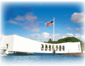
Reserved Ticket for Arizona Memorial (75 minutes)