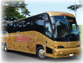
Royal Star® Deluxe Gold Motorcoach will pick you up

In the comfort of a Royal Star® vehicle with seat belt, advanced audio / video system and Royal Star® driver guide.