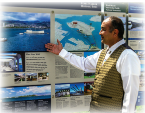
Driver Assists at each stop