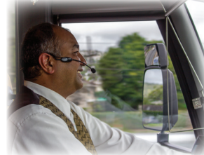
In-Depth Driver Narration