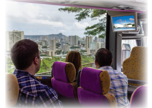
Onboard Historical Video